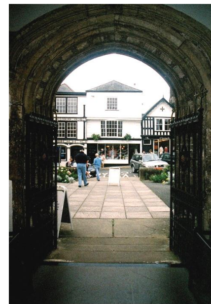
Transition Town Totnes

• There have been numerous projects and events in the diocese on food, diet and the environment – such as a 'Food for Thought' conference.