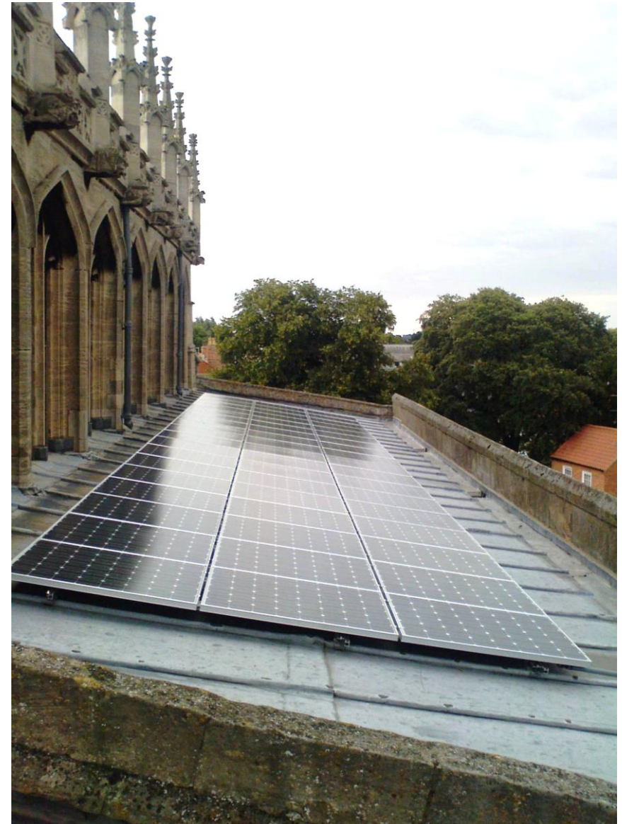
St Denys's Sleaford