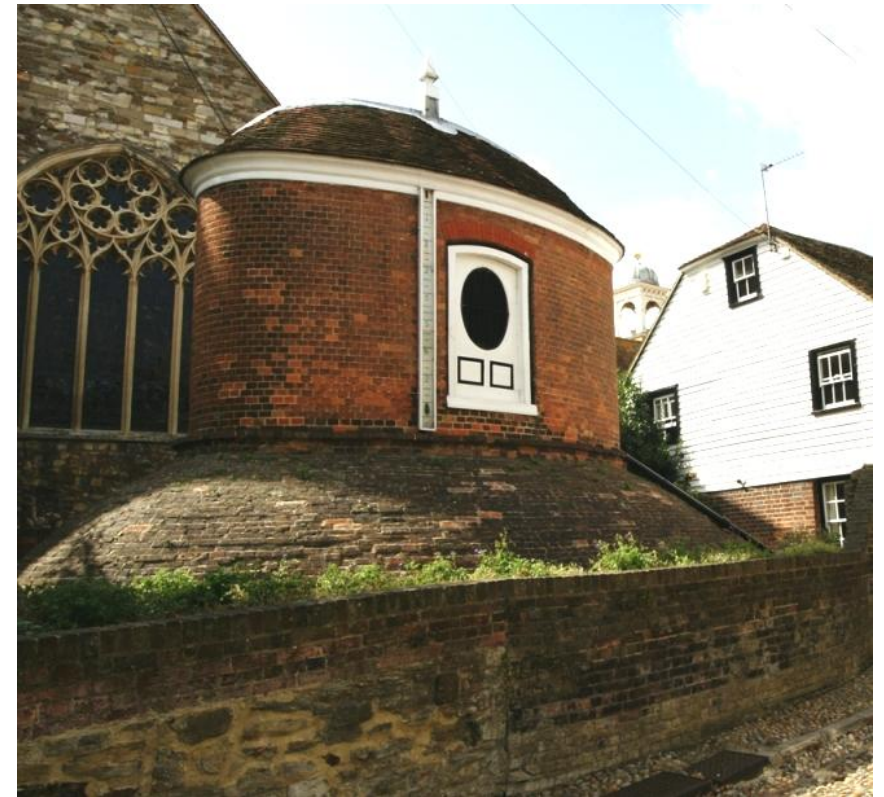
A town and its water: historic cistern, Rye Churchyard, Chichester Diocese

This Seven-Year Plan is commended to the Church of England at large, in anticipation that it will find full and innovative expression in the plans of dioceses and parishes as they make their contributions to 'Shrinking our Footprint' – but expanding our contribution to sustainability and lighter living on 'God's planet' – the good earth that we share.