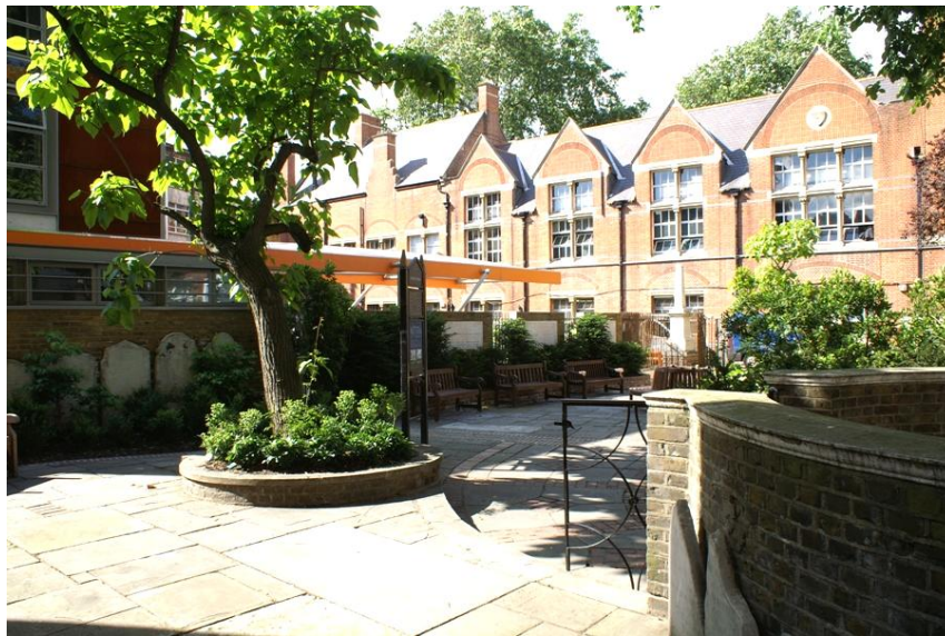
Marylebone Church of England School, from Marylebone Old Church garden