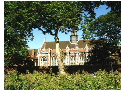
Lambeth Palace, London