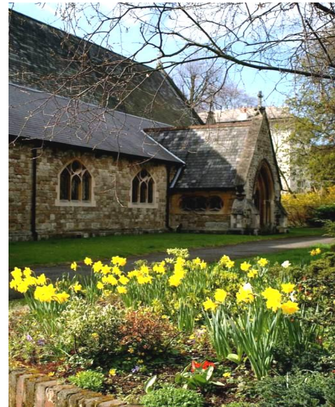
Christ Church Wimbledon (right)

Christ Church, West Wimbledon has held two community eco-festivals and plans more. These have brought together local politicians, campaigners, producers and community groups, and have provided an opportunity for debate, celebration and awareness-raising. A weekly Green Prayer is offered each Sunday. Jonathon Porritt has been among contributors to an annual lecture series on the environment and sustainability.