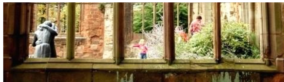
Coventry Cathedral: devastation, reclamation, hope